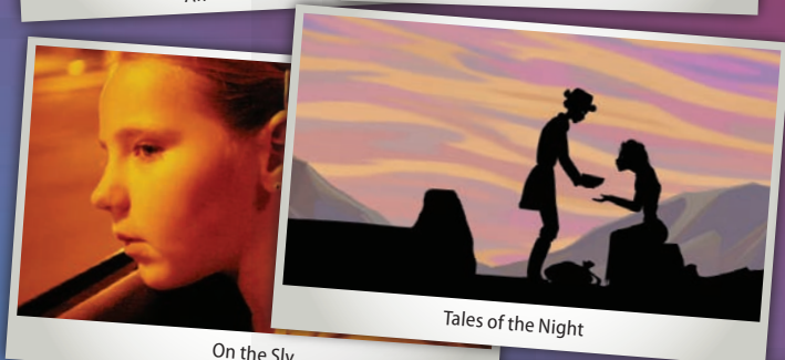
On the Sly