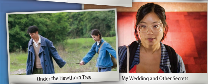
Under the Hawthorn Tree

SCREENINGS Screening times will be announced in the full MIFF program on 5 July