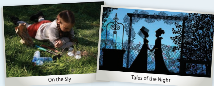
On the Sly

All films are accompanied by free study guides written by Australian Teachers Of Media Inc. (ATOM).