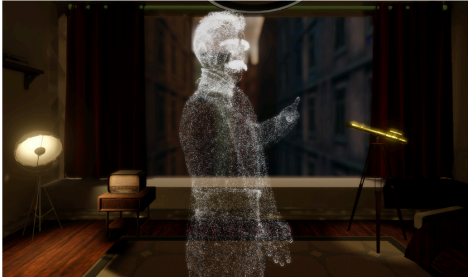
Queer Utopia: Act I Cruising