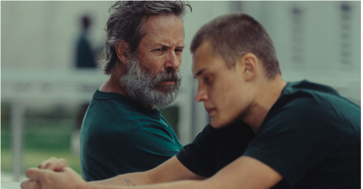
Inside (Premiere Film Fund)