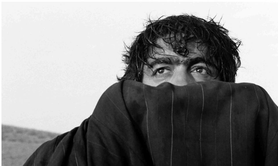
The Cow screening as part of Iranian New Wave: 1962-79

Hear My Eyes is back at MIFF once again, presenting bonafide Australian cult-classic Wake in Fright in a World Premiere NFSA 4K restoration alongside a new score from instrumental jazz-funk journeyman Surprise Chef at Arts Centre Melbourne.