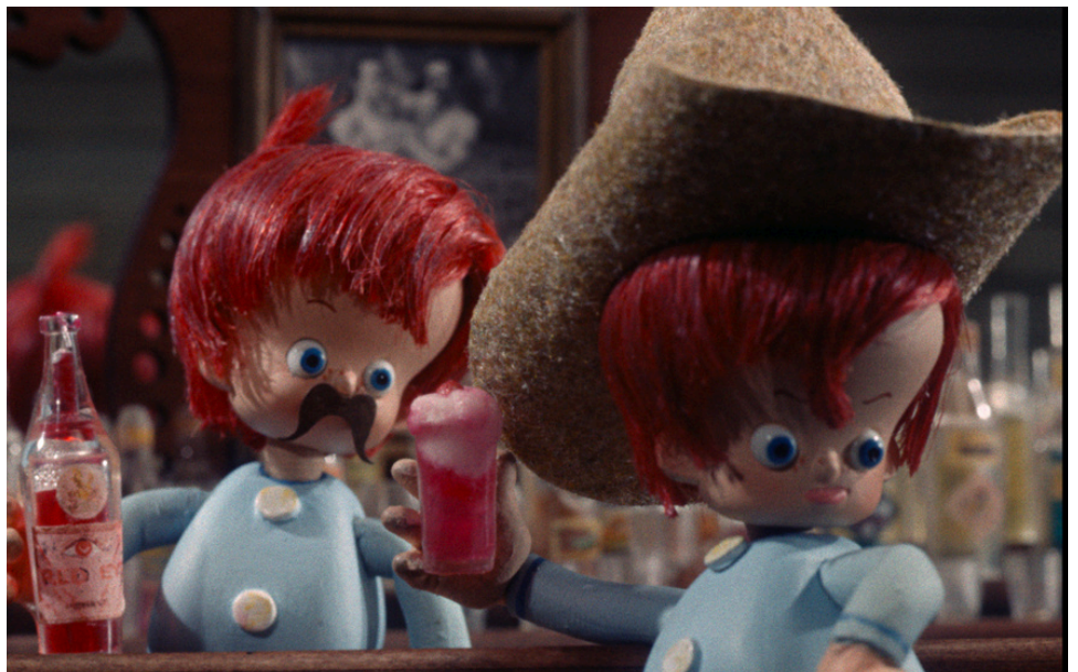
Back From the Ink: Restored Animated Shorts