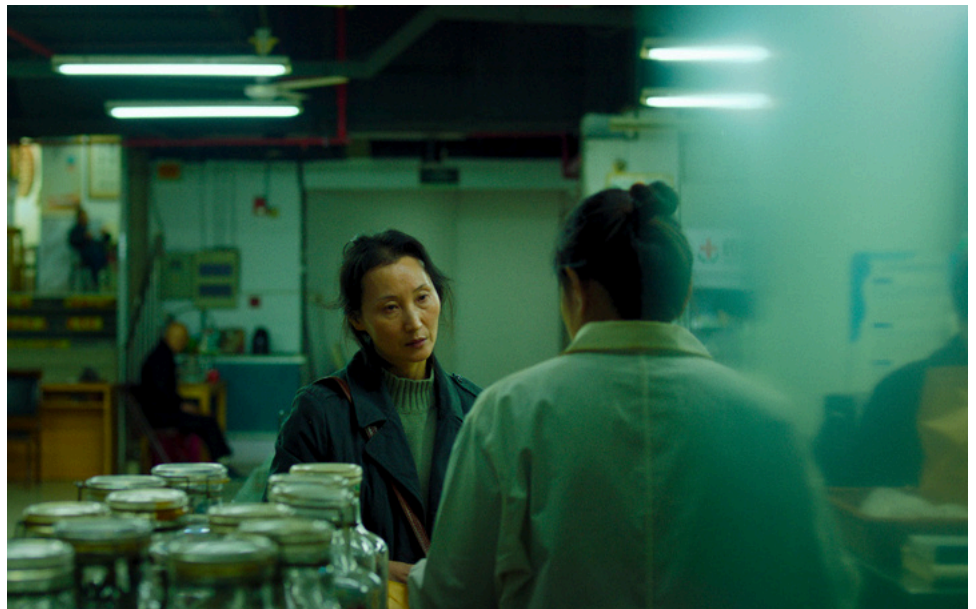
Some Rain Must Fall