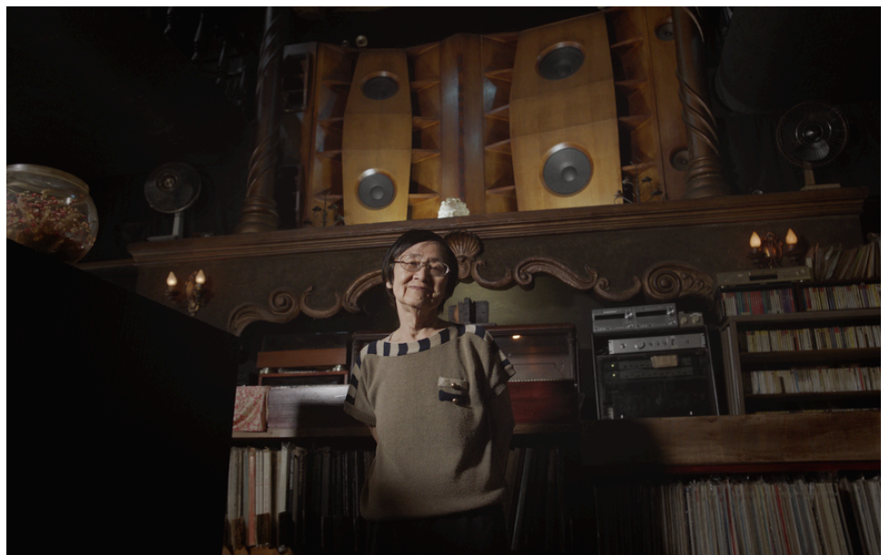
A Century in Sound