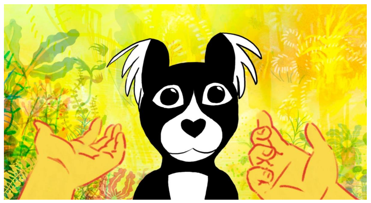
Marona's Fantastic Tale

Following the successful delivery of the Melbourne International Film Festival (MIFF) 68½ public program, MIFF has commenced its education program, MIFF Schools, which streams nationally until 17 September. Today, the program's first-ever Youth Jury announced the winner of the 2020 Outstanding Film award: Anca Damian's Marona's Fantastic Tale , with a special mention given to Samuel Kishi Leopo's Los Lobos .